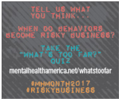
What's Too Far Quiz Call to Action (180 x 150 px)