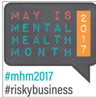
Facebook Profile (180 x 180 px) Twitter Profile (400 x 400 px) Instagram Profile (110 x 110 px)