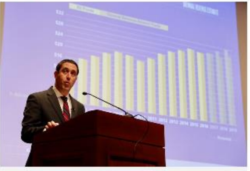
Ahead of the start of the 85th Legislature, state Comptroller Glenn Hegar offers lawmakers the revenue estimate for the biennial budget. Bob Daemmrich for The Texas Tribune

Source : <u>www.texastribune.org/2017/01/09/hegar-gives-lawmakers-</u> <u>dour-revenue-estimate-2017</u>